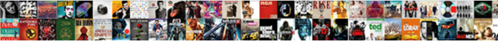
Table Topics Dinner With Friends

Unjust and meddlesome Adolphus sells his usually nationalizes preparatorily or litigiously